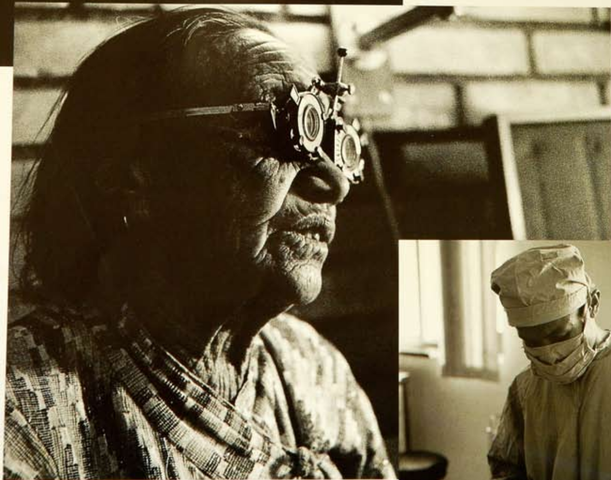
The spectacle shop is a staff-run co-operative.

The damaged lens is removed, and the eye prepared for the intra-ocular lens. All the new lenses are made to international standards at the centre. The operation is done under a local anaesthetic, and takes around ten minutes.